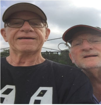
Our Knights that cut and Trimmed grass at the cemetery in May.