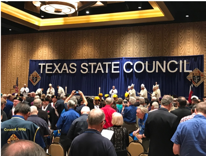
Opening Mass for the 2018 Texas State Convention

Below are some pictures from the 2018 Texas State Convention